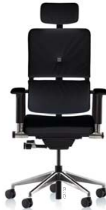
Please Executive Upholstered in stitched leather, featuring a 2D headrest and 3D armrests