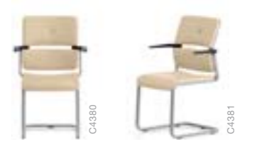
New design - Sled base (non-stackable)