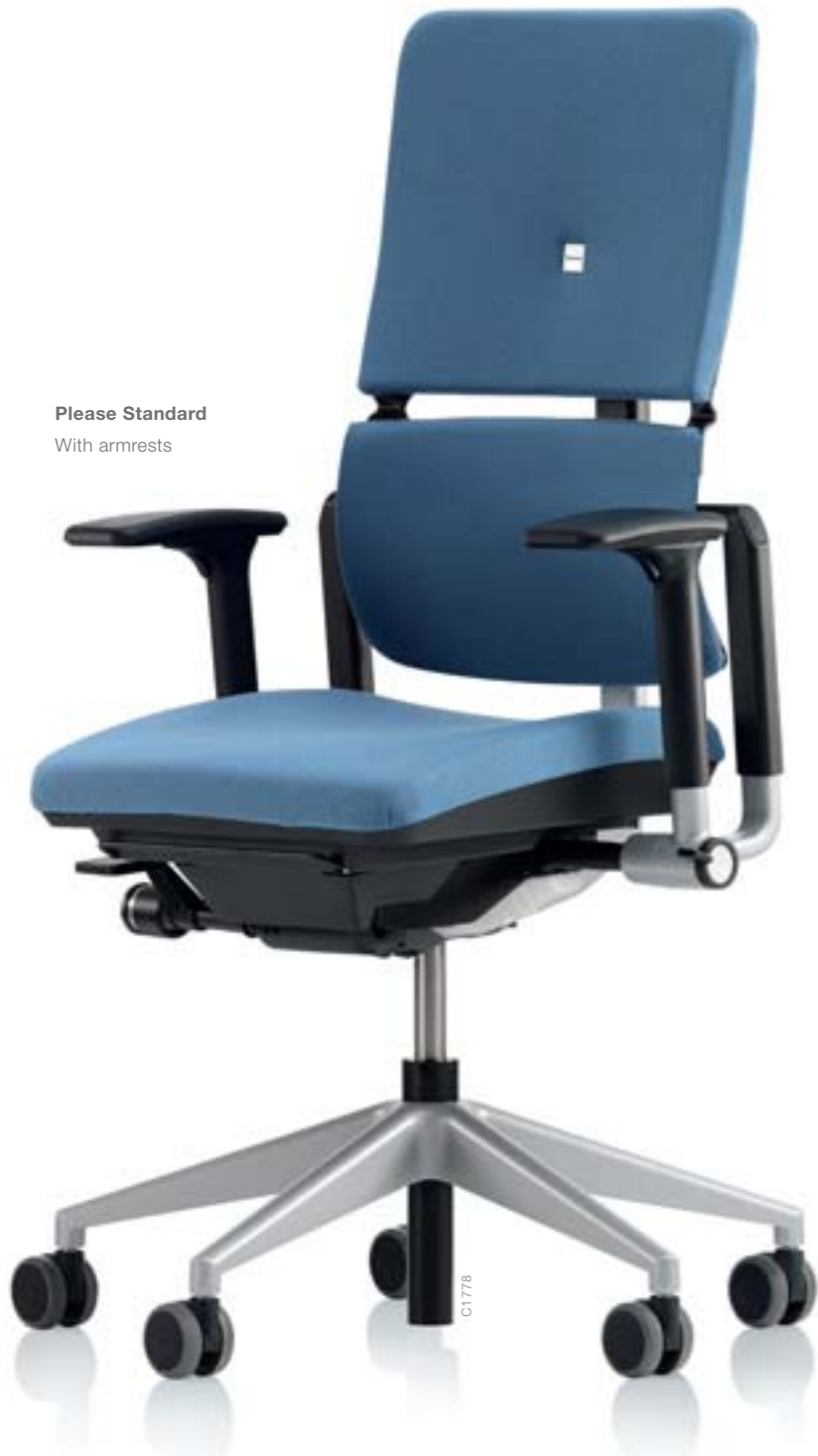
Please Standard With armrests