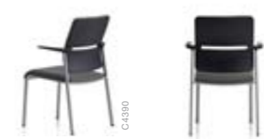
New design - 4 legs (stackable)