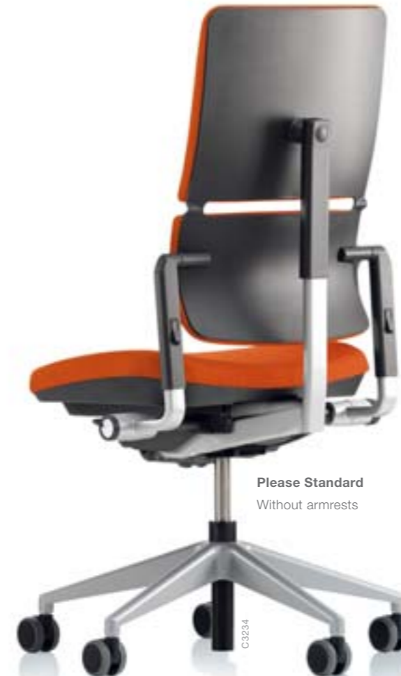
Please Standard Without armrests