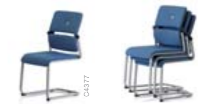
New design - Sled base (stackable)