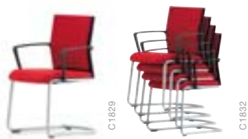
Sled base (stackable)