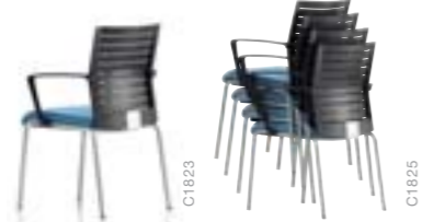
4 legs (stackable)